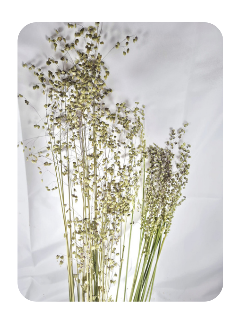
Briza Grass ö