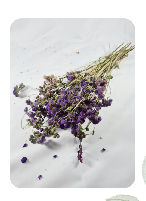
Argentums (Mixed Colours Purple, White , Pink) ö