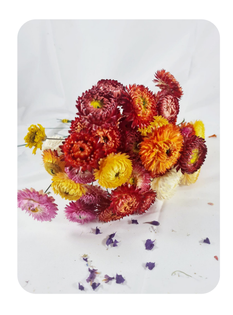
Strawflowers (wired) #2 ö