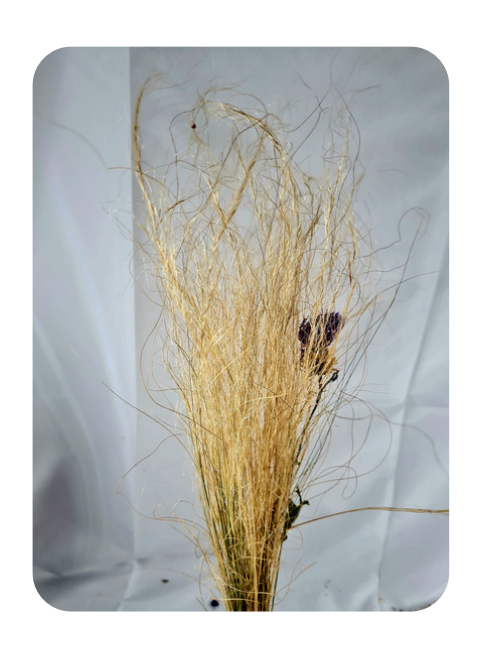
Feather Grass ö