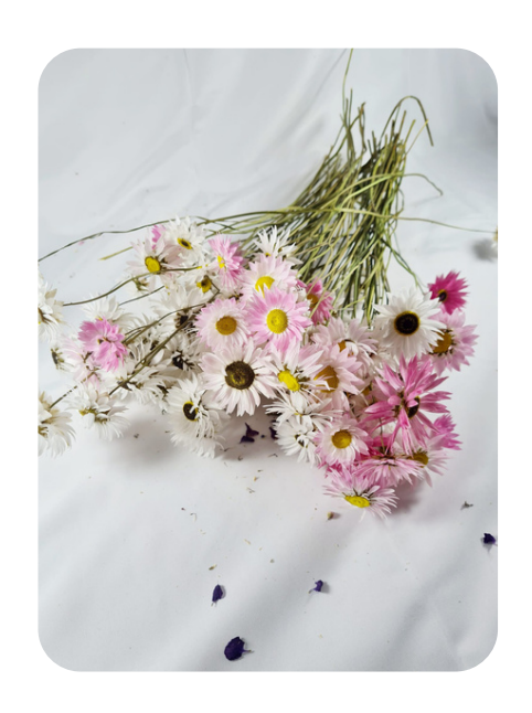
Heliptermums / Acroclyniums ö