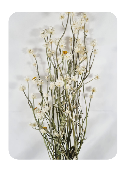
Ammobium Alatum ö