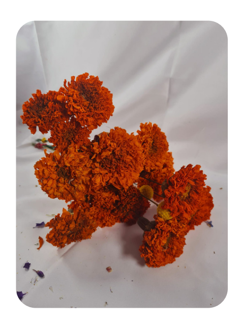
African Marigolds (Wired) #2 ö