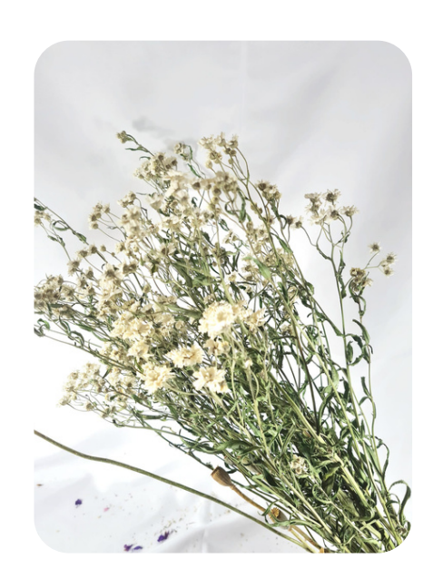
Achillea Permeta Pearls