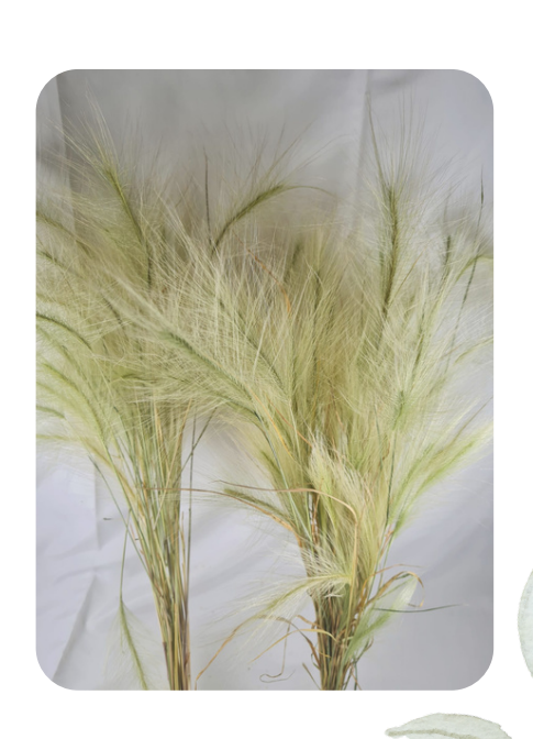
Squirrel Tail Grass