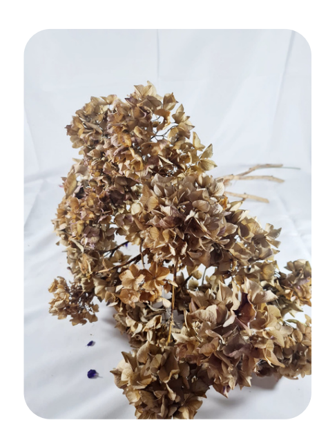
Hydrangeas (Mop Head and Paniculata)