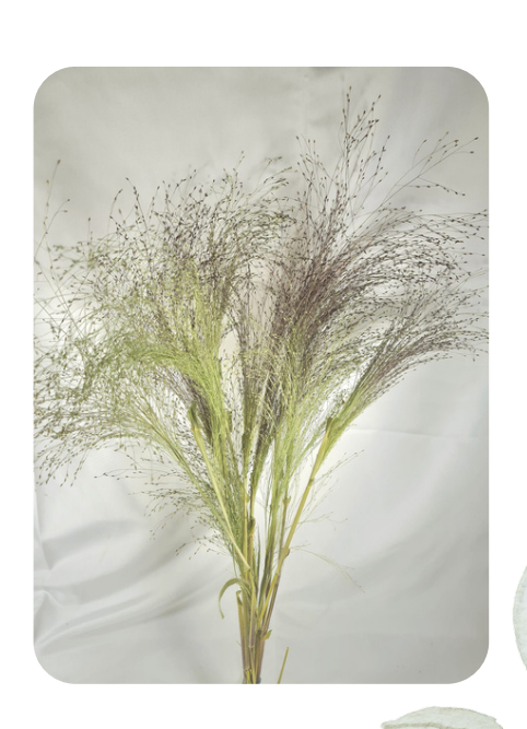
Sparking Fountain Grass Heads ö