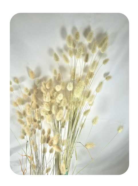
Bunny Tail Grass ö