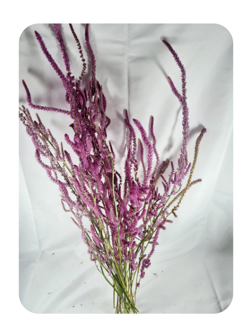
Statice Pink Pokers ö